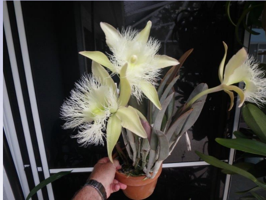
Rhyncolaelia digbyana 'Alpha' AM/AOS—Matt Riesz