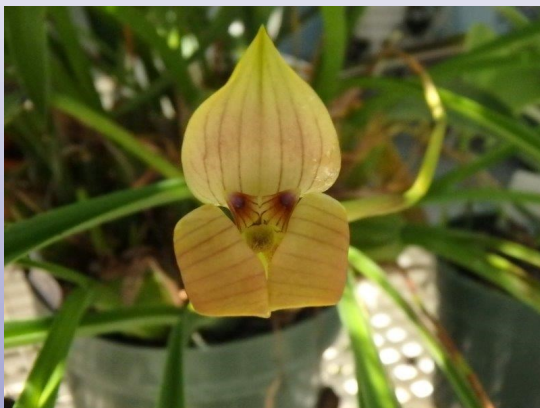
Trigonidium egertonianum—Matt Riesz