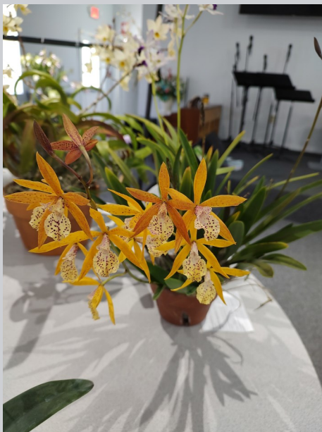
Encycyola Jairak Canary