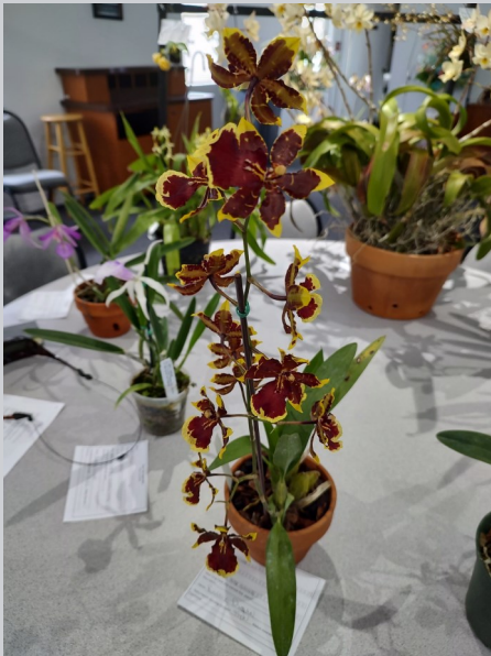
Onc. Wildcat 'Golden Red Star'