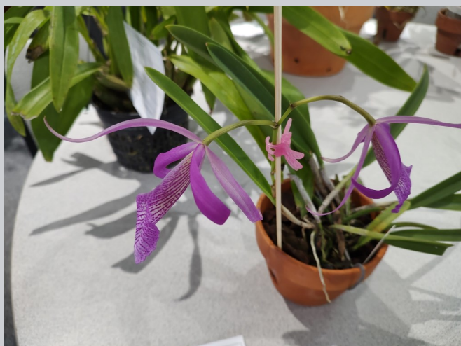
B. nodosa 'Susan Fuchs' x C. purpurata