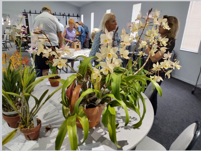
Jkf. Apple Blossom