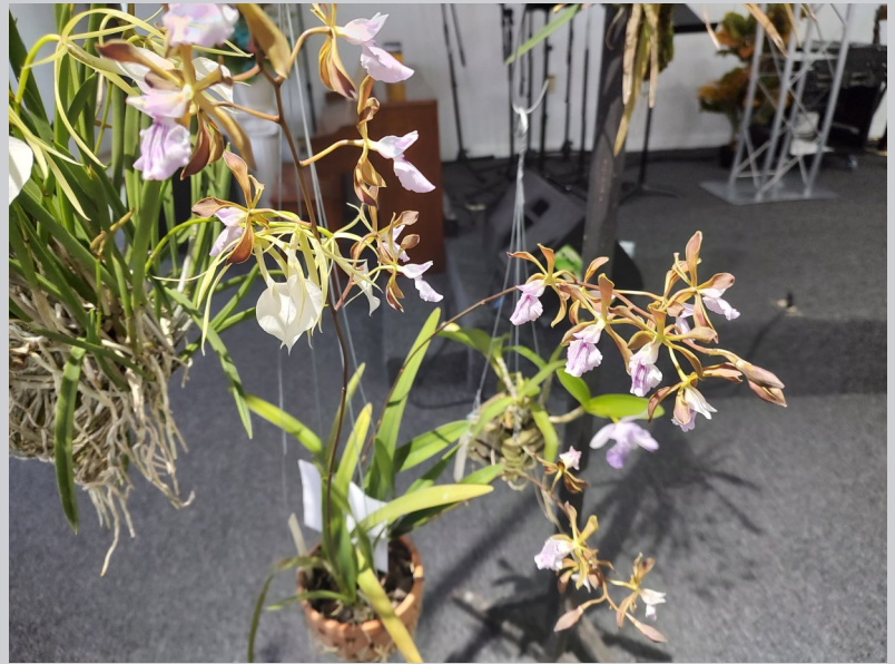
Encyclia 'I'm Telling You 'Key Largo Jungle'